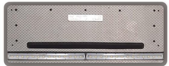
Fig.2 NuvoScan E

Vehant's Team proposed the deployment of NuvoScan E, an advanced Under Vehicle Scanning System (UVSS), at Ram Janmabhoomi, Ayodhya, to effectively address security threats and ensure the safety of the premises. We focused on installing NuvoScan E, strategically designed to provide comprehensive vehicle screening while minimizing disruption to traffic flow.