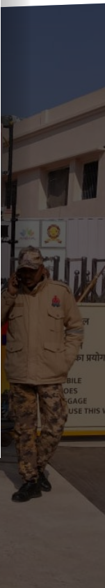
Fig.1 NuvoScan E | Ram Janmabhoomi at Ayodhya, Uttar Pradesh, India